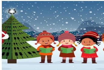
PHOTO & LETTERS W/SANTA

We are excited to continue the tradition with a brief visit with “Santa” in a safe and responsible way. Take the opportunity to deliver your letters right to Santa and take a picture using your own camera.